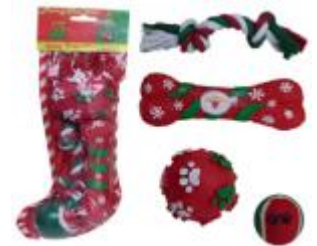
Hang one by the chimney with care

Each one is inexpensive (yea!), brightly coloured and filled with a fun and festive rope, ball and two squeaky toys. Grab yours now.