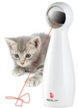
The fun new way to drive puss mad

Change it to manual and you get to play too! Hold it in your hand to create unique laser patterns, and watch your baby pounce, chase and bat to her heart's content. PS. Dogs fall for it too - try it on your pup!