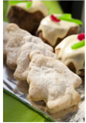
Yum - good enough for humans

Be sure to keep them with the doggie treats - they look so luscious, someone in your house might just woof 'em down themselves.