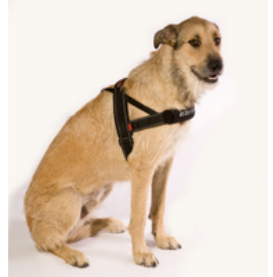
I'm so comfy in my new harness!

These are particularly good for Pugs and any dogs with breathing issues, as they fit comfortably well away from the dog's neck.