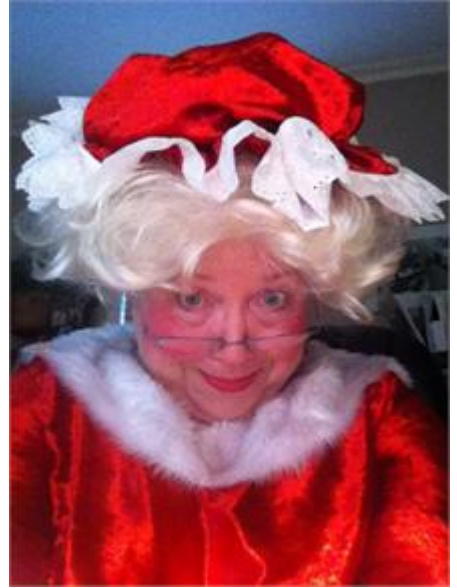
Mrs Claws wants your baby on her lap