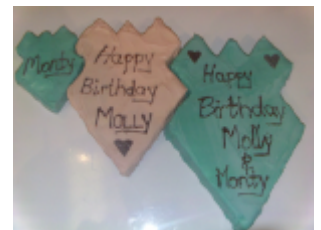
Choose from three cake sizes

Only the best ingredients are used - for example, honey and molasses as natural sweeteners, lots of rolled oats and wheat germ and real nuts and free range eggs. No preservatives, artificial flavours, salt or sugar. Best of all, dogs just love them.