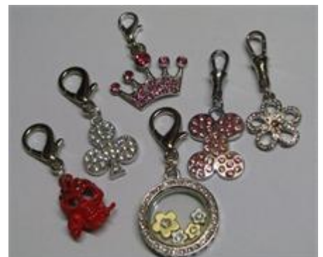
Jewels fit for your little prince or princess

Our luxury collection of stylish and contemporary high quality accessories includes sparkling jewellery and Swarovski crystal charms. Starting at a modest $8.00, a little bit of bling for your baby has never been so affordable.