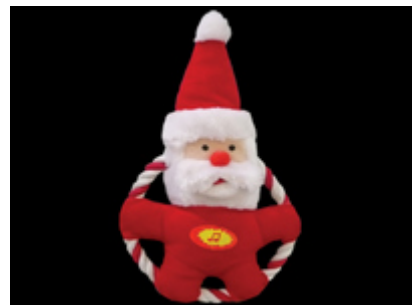
Santa's brought fun NEW Christmas toys galore