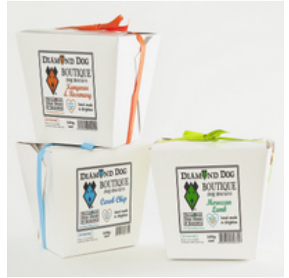
Treats with the added benefit of Chia seed

All Diamond Dog treats are made by hand on the premises locally in Brighton. Chocked with beneficial vitamins and proteins, they're good for your dog's wellbeing - and yummy too. Try kangaroo & rosemary, moroccan lamb, peanut butter - no boring flavours!