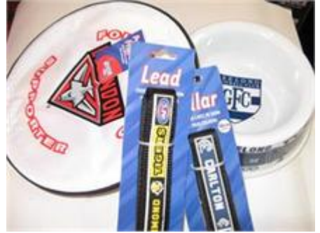
We have most teams' merchandise in stock