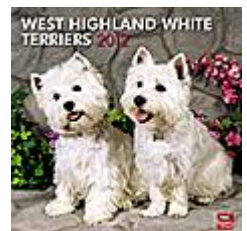
Grab yours before they go

But they fly out the door, so if you want to be sure to get yours, get in fast - or give me a call to put one aside for you.