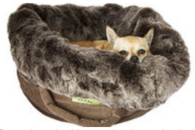
Snuggle up in this amazing luxury bed

Denny Hill's MAISON DOG luxe dog and cat 'pods' are crafted for the fussiest sleepers and snugglers. Made of high quality fashion fur and denim, they're machine washable, reversible to change with the climate and irresistibly squishable and moldable to your snuggler's favourite possie. Sizes to fit everyone from the tiniest cat to the biggest woofers.