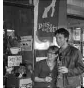
Up close and personal with our gorgeous celebrity photo judge, Hamish Blake

Our heads were also turned by Katrina Warren's TV visit with her famous dog pal Toby - see page 3 inside.