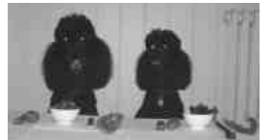
Wallis and Gable Donovan taste some p&tc Yuletide treats

Personally autographed copies of Gail's delightful book, Walking the Dog in Italy , are in store now. Plus we'll be giving 2 away to 2 lucky customers who spend just $10 or more at Twilight Trading from 6.00-9.00 pm on 7 December.