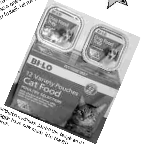
Competition winners Jambo the beagle and Tom the moggie have now made it to the BiLo supermarket shelves.

Don't forget to bring in your favourite pet pic for our Fabulous Fursts Photo Competition. Bring it on the day – or drop it in any time before August 1 - for your chance to win a $175.00 portrait sitting for your little star.