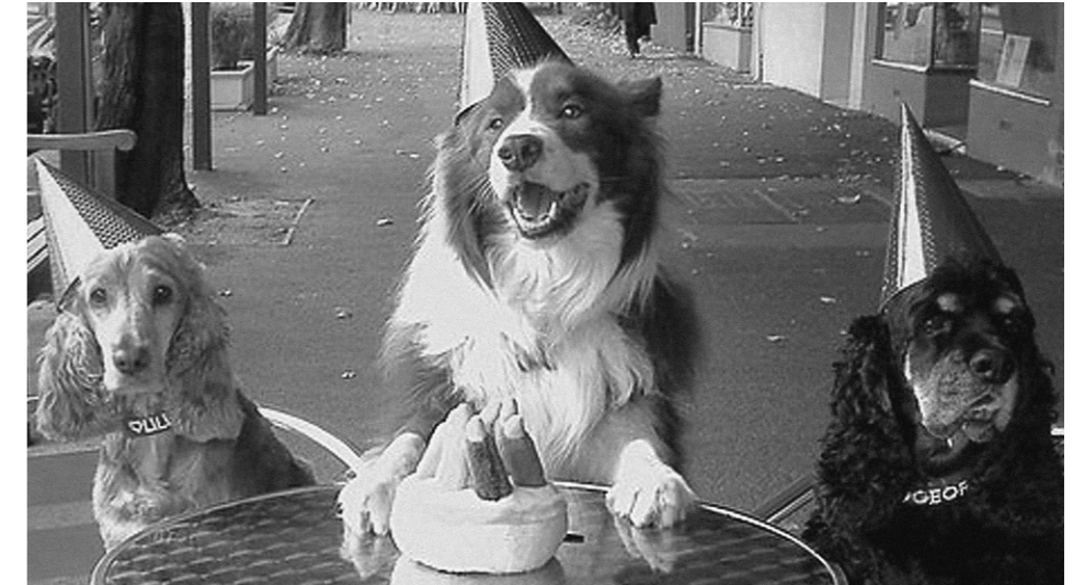
Happy BRRRRRRthday to us!

In this colder-than-cold bayside winter, we're gearing up for a frosty, fabulous, 3rd birthday blow-out.