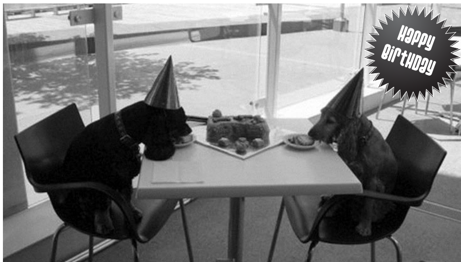
Georgie and Lilly celebrate their 8th (or 52nd in dog years) birthday.