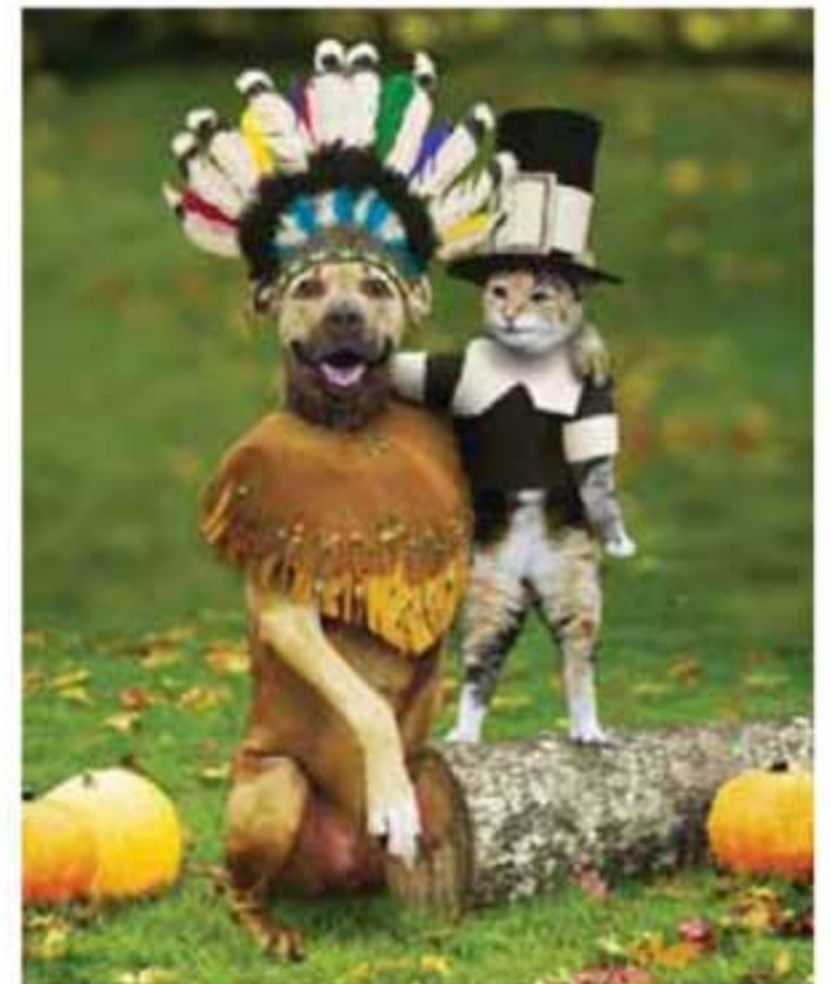
In the US, Native Americans and Pilgrims are the symbols of Thanksgiving harmony. Looks like those American pets know how to celebrate!

PS. Two big events coming up at p&tc this month too. See below and be sure to act quickly to reserve your place.